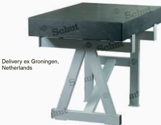
Delivery ex Groningen, Netherlands