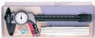
837.209: set with folding rule of 1 m

Item No. Description 837.207 Vernier caliper 837.205 Dial caliper 837.209 Set of dial caliper 837.205 with a folding rule of 1 m 837.201 Digital caliper Option: 836.535 Spare battery