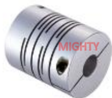
Parallel Clamp type FC-P2