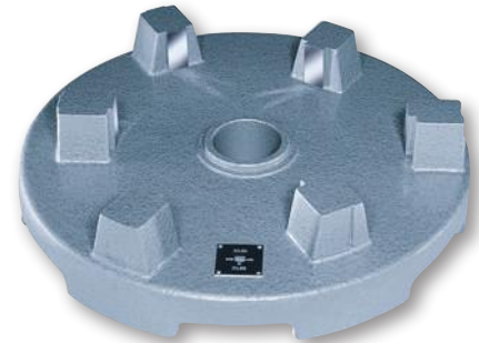
Setting standard 225-275 mm