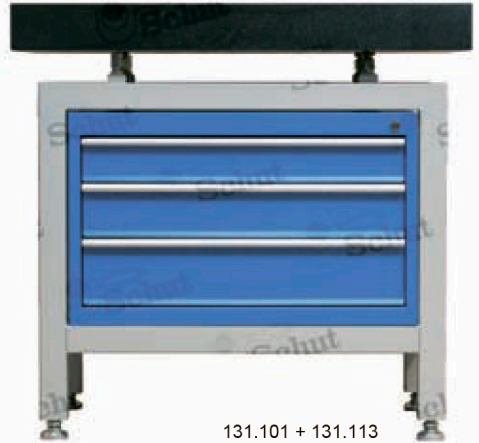
131.101 + 131.113