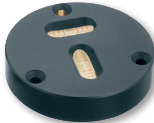
Model B: Circular level with cross vials, 3-point mounting. Aluminium alloy protection case, anodised.

The 2 vials permit a simultaneous alignment in the X and Y axes. The level can be screwed on to a surface.